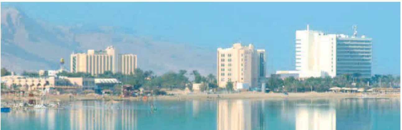
View of Ein Bokek